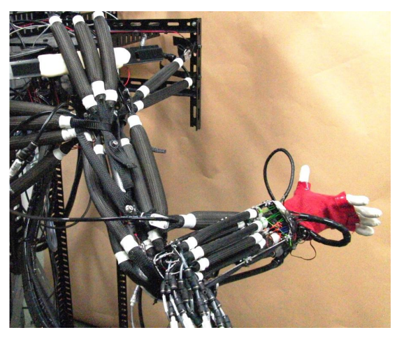
Fig. 1 The developed musculoskeletal robot arm.

In this research, we develop a musculoskeletal robot arm based on a human's upper limb musculoskeleton in order to investigate how the design contributes adaptive behavior of human beings. As one of tasks which a human naturally does, we focus on a task in which the developed robot arm reaches and grasps a doorknob and opens the door. This door-opening task, where the robot arm has to physically contact with the doorknob, is known as one of most difficult task for traditional robots[4]. In this paper, we realize the door-opening task by using very simple control and evaluate how the design of the robot arm contributes for the task accomplishment quantitatively.